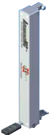
AMC Double Compact Configurations