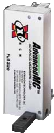
AMC Single Full-Size Configurations