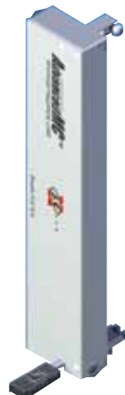
AMC Double Full-Size Configurations

Customizable Solution with Integral Cable Management