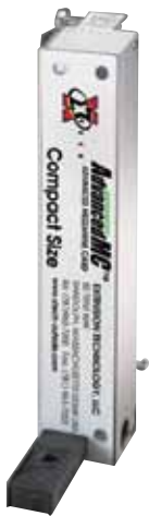
AMC Single Compact Configurations

Overlays Silkscreening Connector Cutouts Custom Cable Management