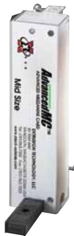
AMC Single Mid-Size Configurations