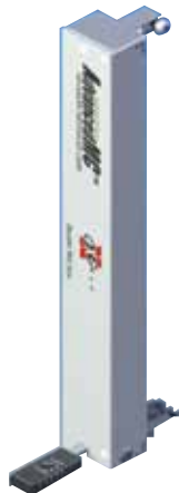
AMC Double Mid-Size Configurations