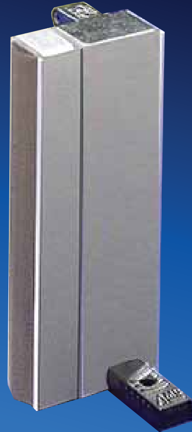
Double 2HP Extender