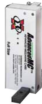
AMC Single Full-Size Configuration