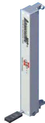
AMC Double Compact Configuration