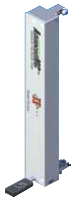
AMC Double Mid-Size Configuration