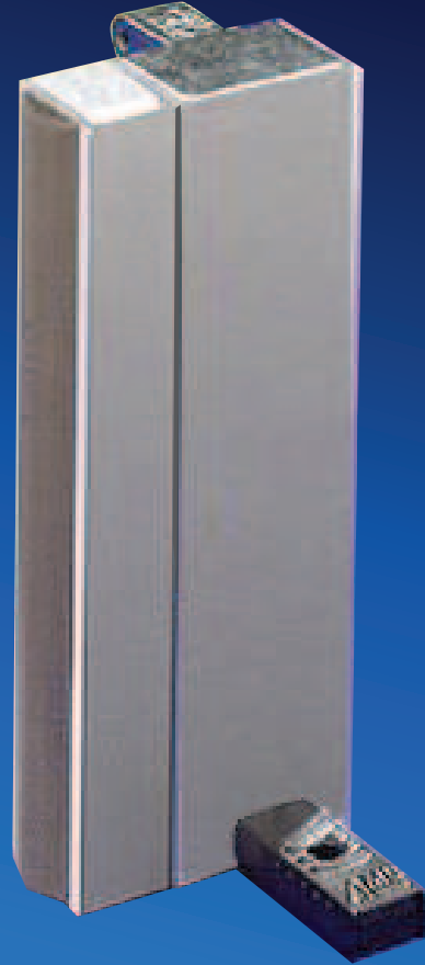
Double 2HP Extender